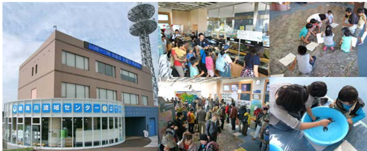
地域防災施設 鶴見川流域センター Tsurumi River Disaster Prevention Center