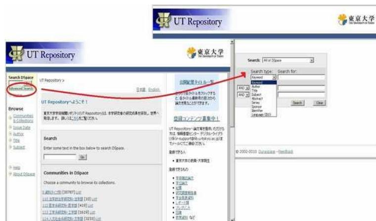
(Quick search window and refined search window)

Clicking on the category buttons on the top page will take you to the specific Advanced Search screens