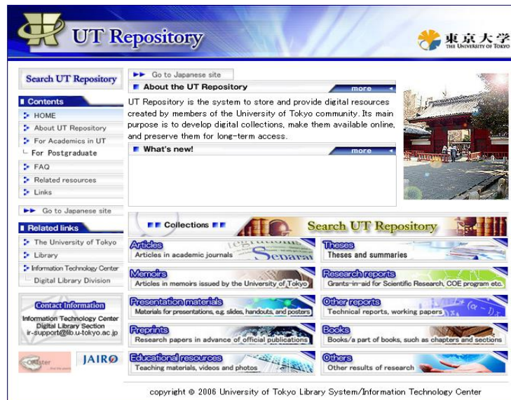
Opening page of UTokyo Repository

( http://repository.dl.itc.u-tokyo.ac.jp/index_e.html )