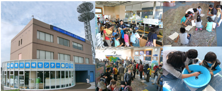
地域防災施設 鶴見川流域センター