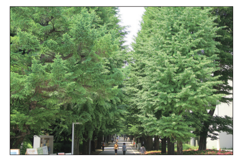
Row of ginkgo trees

ters for African Studies, Sustainable Peace, and Sustainable Development. The IAGS was joined a year later in April 2011 by two more new centers, one dedicated to Asian Studies and the other to Middle Eastern Studies (UTCMES). The Komaba Organization for Educational Development (KOMED), established in 2005 to further improve undergraduate teaching in the College of Arts and Sciences, merged with the Center for Structuring Life Sciences